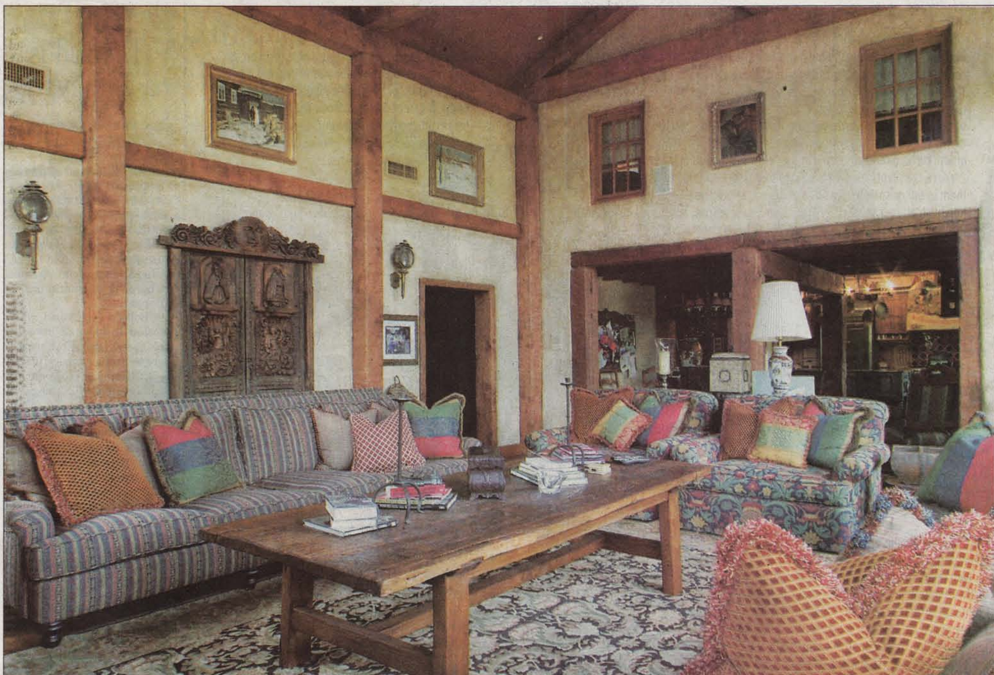
LOFTY ADDITION: Tara Hitchcock's central Scottsdale home is inspired by the look of a French chalet. The newly added family room at the back of the house is Hitchcock's favorite spot. Distressed wood beams crisscross textured plaster walls, and Russian artwork borders the top half of the room. One antique wooden door decorates the wall while another is used as a coffee table in the center of the room. Custom-made oversized couches are big enough to hold the entire family on TV nights.

trips and they're in albums, but scrapbooks are cool because they're right there, with a picture on the front and people want to thumb through them. And we're reminded of all the goofy stuff that happened.