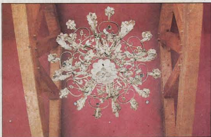
TO TOP IT OFF: An ornate ivory chandelier graces the 10-foot-high vaulted ceilings of the family room.